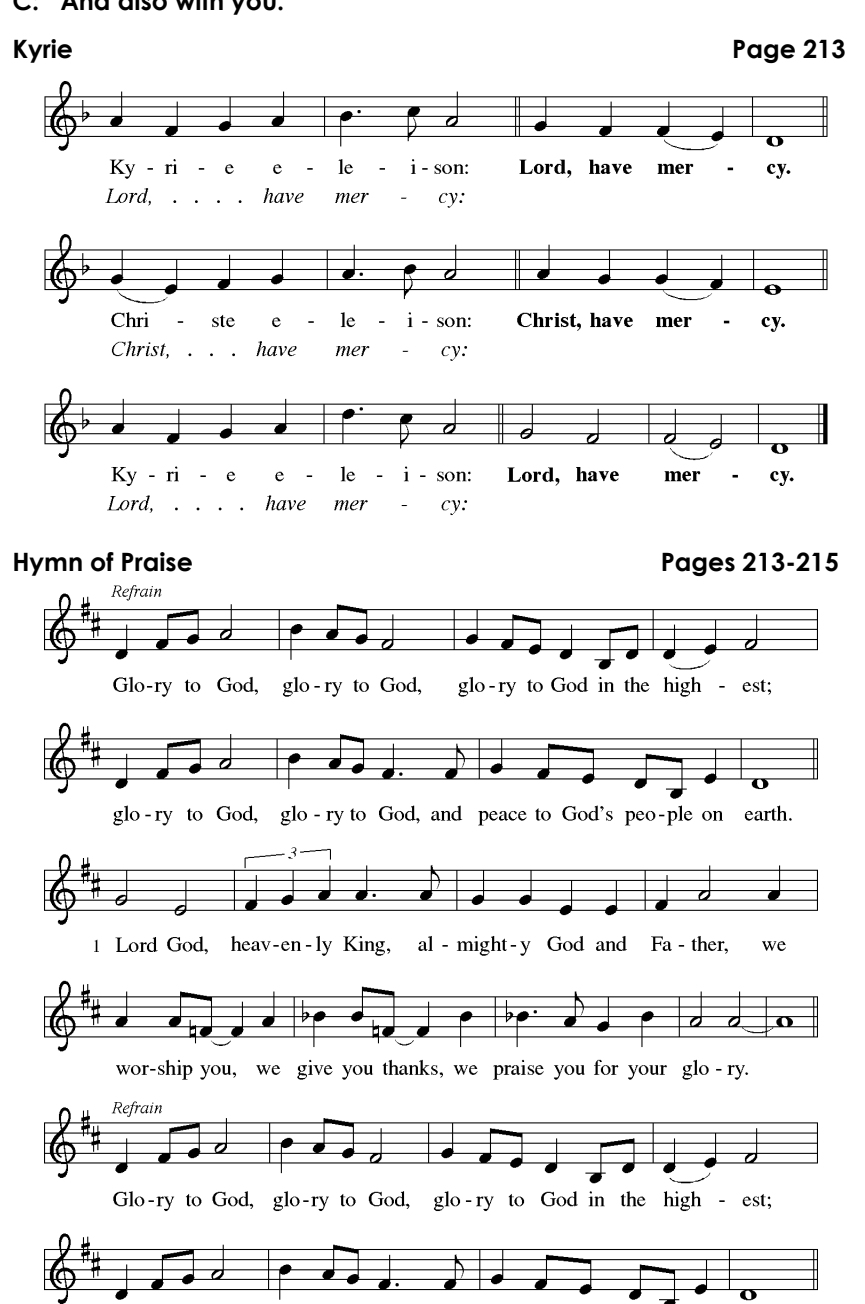
glo-ry to God, glo - ry to God, and peace to God's peo-ple on earth.